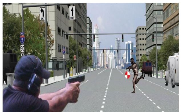
Figure 3: Lead Time Trainer

Lead Time Trainer . This software presents different sized targets that move at different speeds across a presented scene. This allows operators to practice estimating lead time adjustments when engaging moving targets.