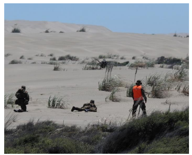
Figure 8: NZ Army soldiers practising section tactics using SARTs.

The system uses batteries for power, allowing them operate autonomously, and it can operate in hot and cold environments. There is also a speaker system to produce sound effects, such as emulating enemy gun fire.