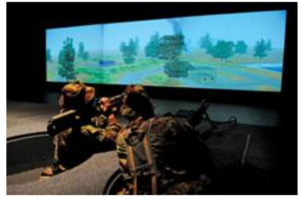
Figure 1: The NZDF Weapon Training System

WTS works by using a computer to generate virtual firing scenarios, which are projected on to fixed screens. Soldiers then sit in a pit in which they operate tethered modified weapons (including assault rifles, light machine guns and anti-tank weapons). Inside these weapons are various electronic sensors that provide information regarding weapon status, such as trigger pressure and orientation. The weapons also employ speakers to emulate firing sound effects and weapon recoil is simulated using pneumatic actuators (compressed carbon dioxide).