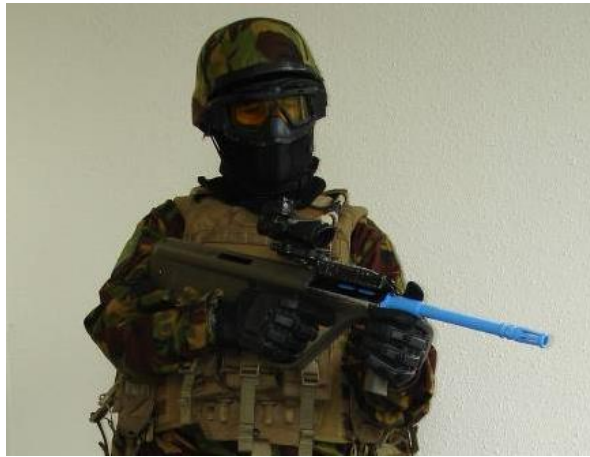
Figure 5: NZDF Man Marking System

Game fields are often scattered with natural or artificial terrain, which players use for tactical cover. Game types vary, but can include capture the flag, elimination, ammunition limits, defending or attacking a particular point or area, or capturing objects of interest hidden in the playing area. Depending on the variant played, games can last from minutes to days.