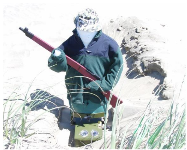
Figure 7: NZDF Small Arms Retaliatory Target

When using the SART for blank firing the plastic target is replaced with an aluminium one with a laser sensor on it. It is then used in conjunction with I-TESS. This is good for urban environment training when live rounds cannot be used.