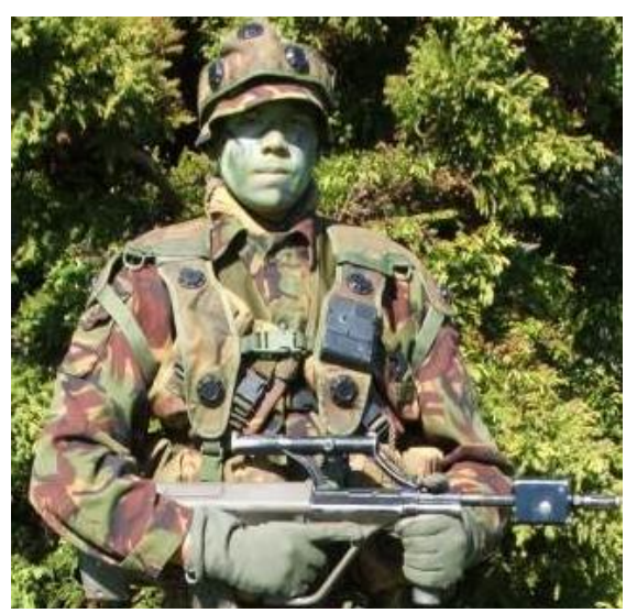
Figure 6: The NZDF Instrumented Tactical Engagement Simulation System

There are also a wide range of different replica weapon options, including claymore mines.