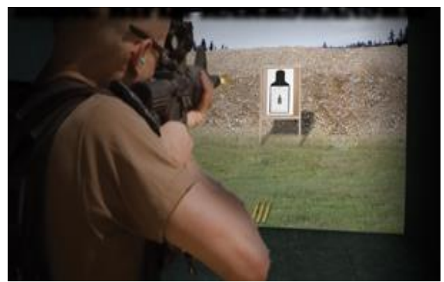
Figure 4: Virtual Firing Range

Virtual Firing Range. Emulates a standard firing range, where virtual paper targets are either static or can move towards the weapon operator.