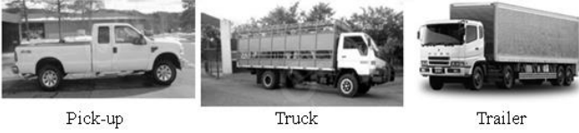
Figure3: vehicle types