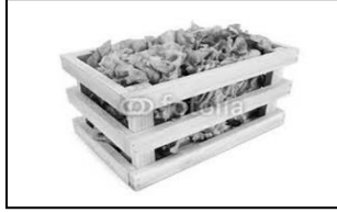
Figure 4: Unit load