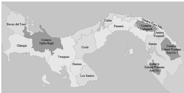
Figure 1: The geography of the Republic of Panama

methodology used and some of the main results of the project.