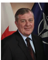
WAYNE BUCK HQ SUPREME ALLIED COMMANDER TRANSFORMATION, NATO