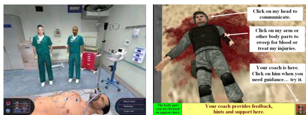
Figura 2. Examples of Medical Virtual Simulation

Medical Sector, both for defence and civil applications, has had and is having a huge evolution creating for sure a new frontier for research and development in Modelling and Simulation.